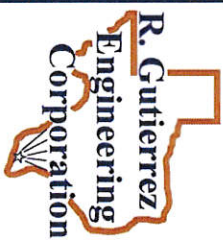
Exhibit B2 – Project Team