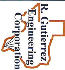
Exhibit B2 – Project Team